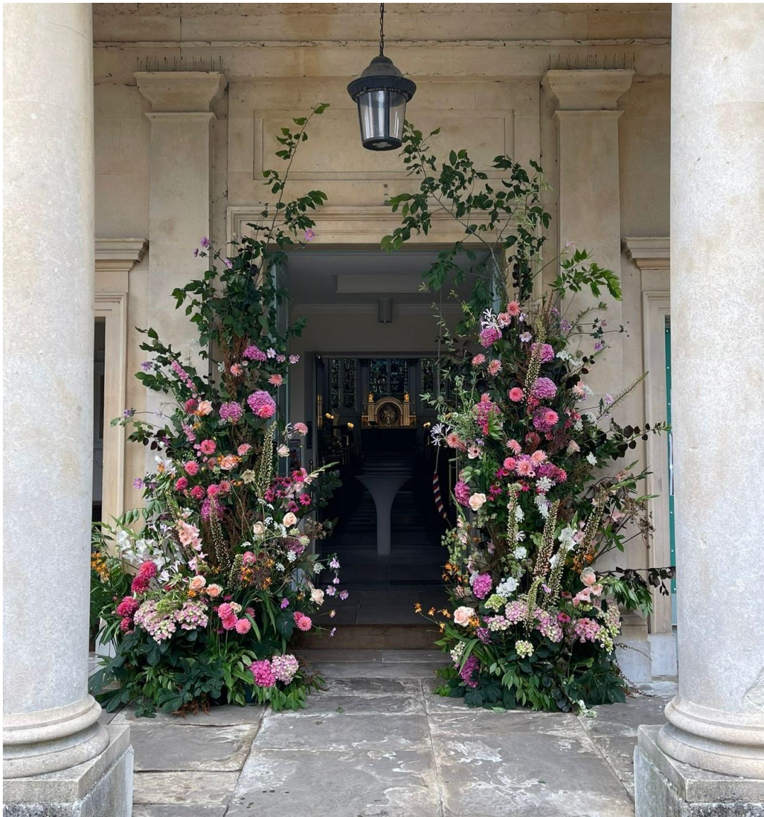
A view of St Anne's August 2024